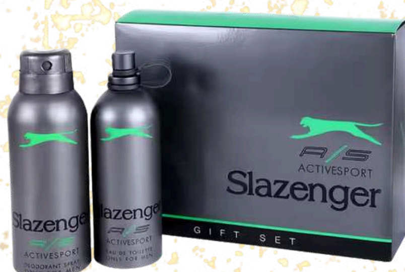
Gift Set Green (1 EDT 125ml + 1 Deo 150ml) Rs 1095