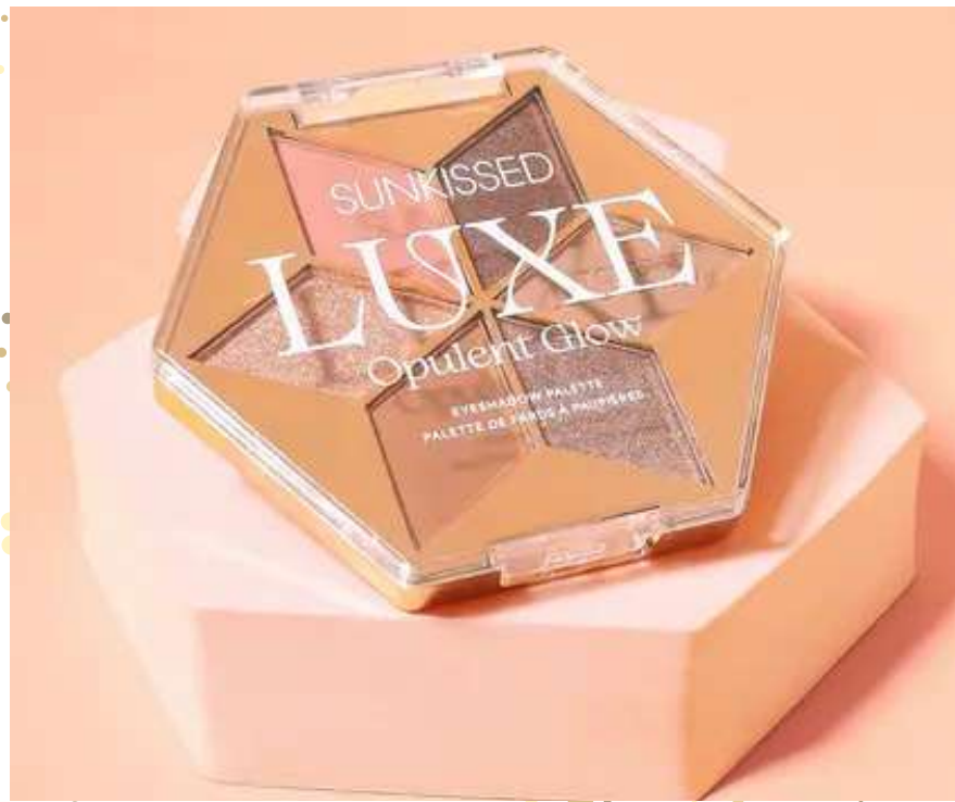
Sunkissed Eye Shadow Palette Luxe Opulent Glow (6 Colors)