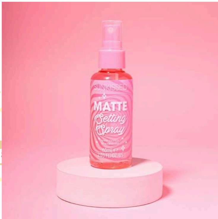
Sunkissed Matte Fixing Spray 60ML