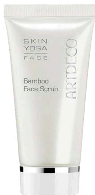
Skin Yoga Facial Scrub Bamboo 50ml Rs 945

The White Tea Cleansing Mousse is a gentle, creamy formula that lovingly removes makeup and impurities without drying her skin. Infused with Oxyvital to boost skin oxygenation and white tea extract to soothe and hydrate, it leaves her complexion clear, calm, and beautifully soft. Because her beauty deserves the kindest care.