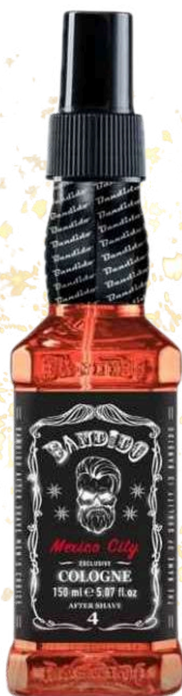
After shave Cologne Mexico City Red 150ml Rs 385