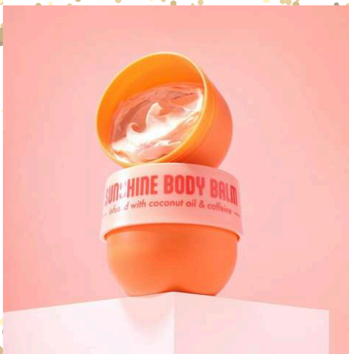
Sunkissed Body Balm Sunshine 200G