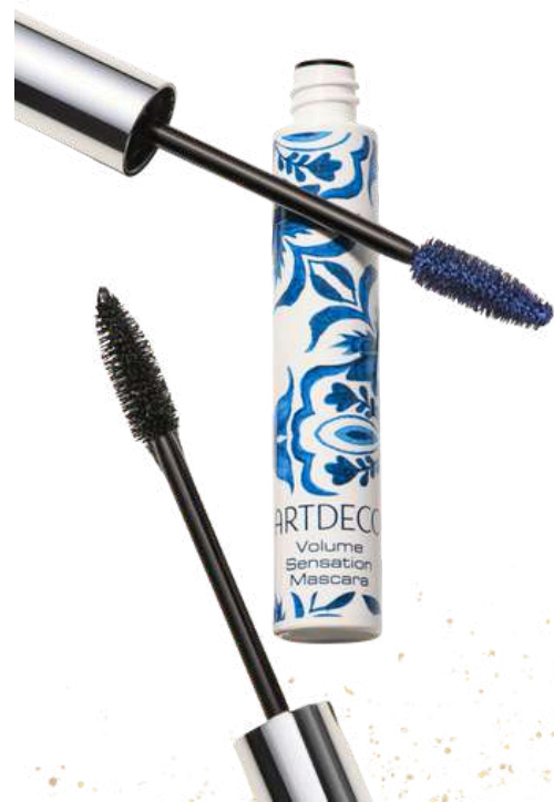
ArtVolume Sensation mascara - limited Edition Rs 870