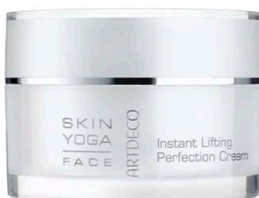
Skin Yoga Facial Cream Instant Lifting Perfection 50ml Rs 1470

The Instant Lifting Perfection Cream is a nourishing treat that firms and revitalizes her skin with every touch. Its velvety texture pampers while high-quality ingredients work to reduce signs of aging, revealing a smooth, radiant, and youthful-looking complexion. Because her beauty is timeless, and she deserves to feel it every day.