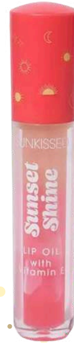
Sunkissed Lip Oil Sunset Shine