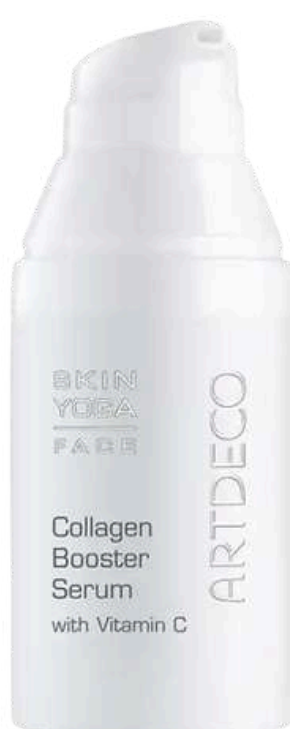
Skin Yoga Facial Serum Collagen Booster 30ml Rs 1060

Treat her to the refreshing touch of Bamboo Face Scrub, an aromatic start to any skincare ritual. With microfine bamboo particles, this gentle exfoliator respects her skin's natural balance while encouraging cell renewal. It leaves her skin feeling smooth, pores visibly refined, and her beauty shining through. A perfect first step in a routine made just for her.