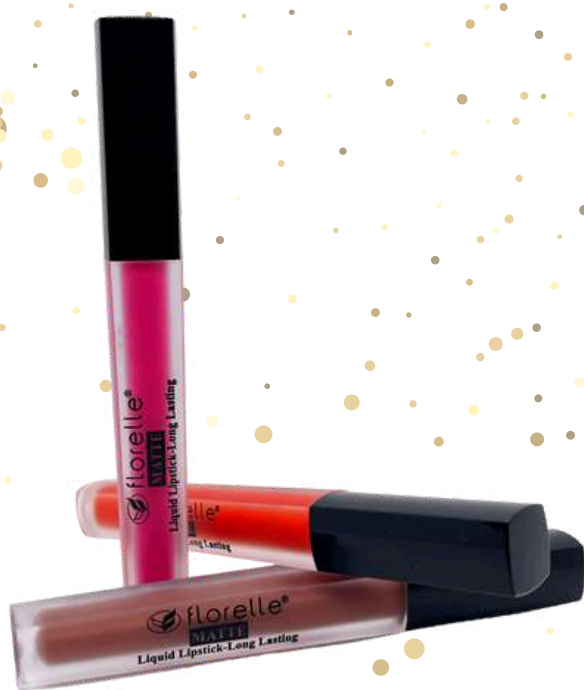
Florelle Matte Liquid Lipstick