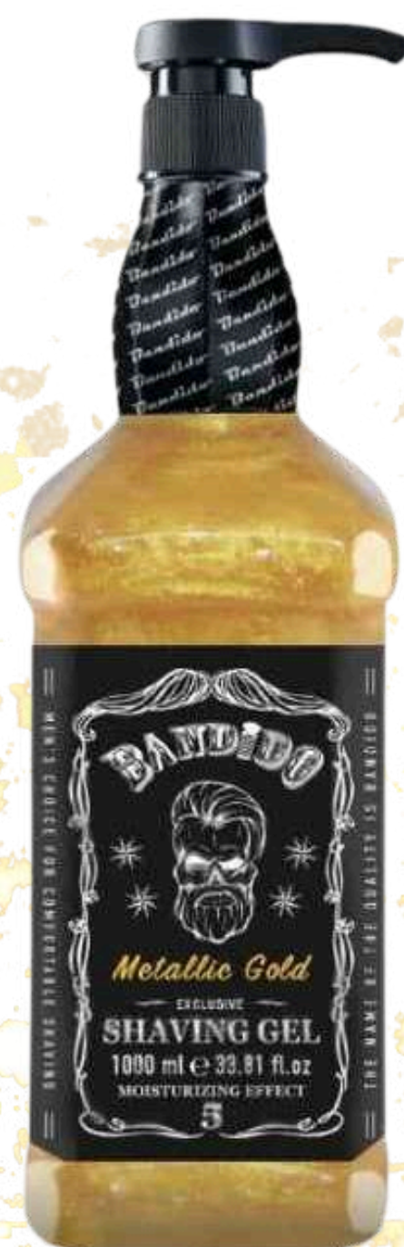
Shaving Gel Silver 1000ml Rs 750