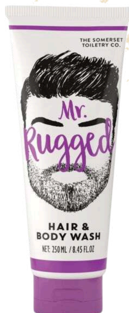
Hair & Body Wash Mr Rugged 250ml Rs 765