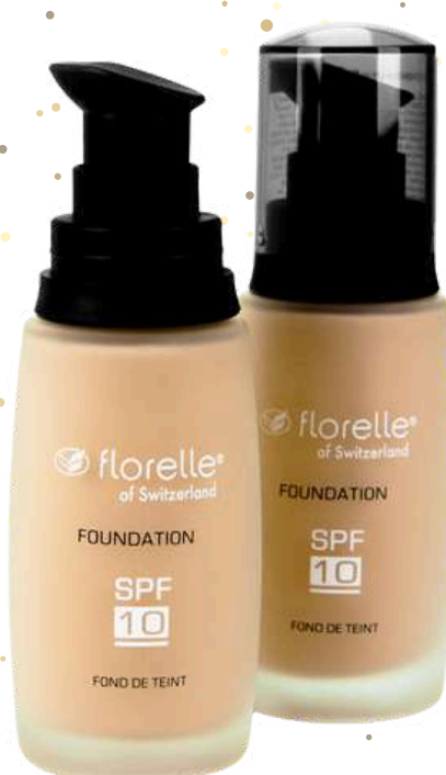
Florelle Spf 10 Foundation