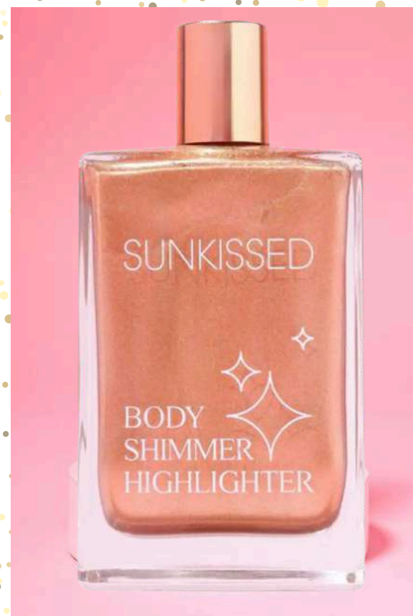
Sunkissed Highlighter Body Shimmer 100ML