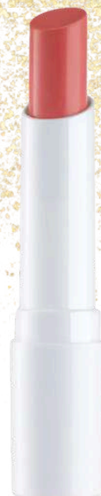
Color Booster lip balm - limited edition Rs 720