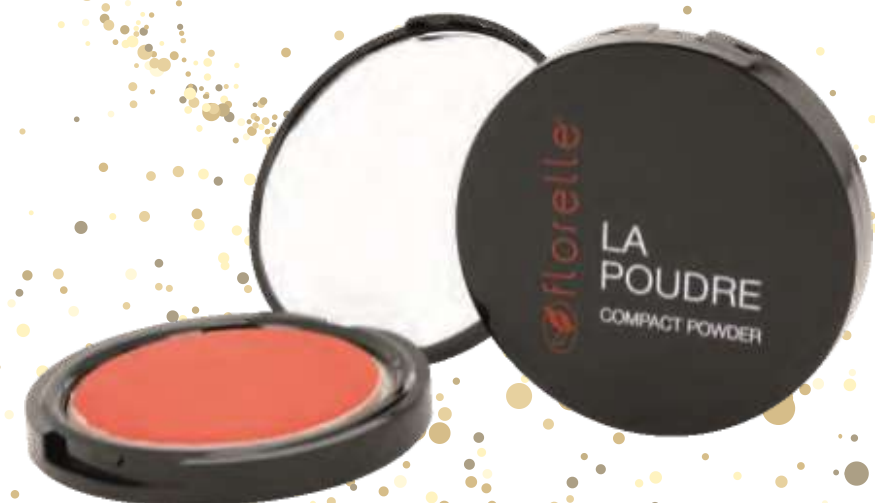
Florelle La Poudre Compact Powder