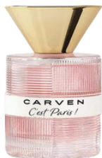
Carven - C'est Paris Femme 30ml - Rs 3750