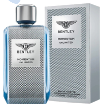
Bentley - Eau De Toilette Momentum Unlimited 100ml - Rs 3570