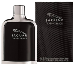
Jaguar - Eau De Toilette Classic Black 40ml - Rs 1685