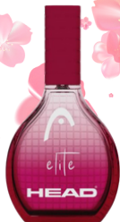
Head - Eau De Toilette Elite 100ml - Rs 1495