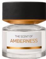
BMW - Ambersness 50ml - Rs 3600