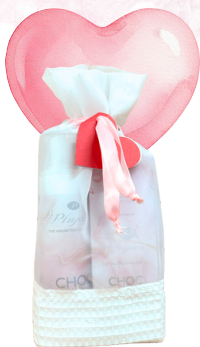
Phydra - Pouch Choc - Rs 995 Eau De Toilette 50ml | Shower Mousse 150ml