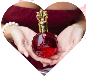
Princess Marina De Bourbon - Eau De Parfum 30ml - Rs 2795