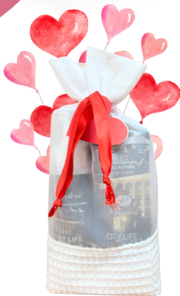
Phydra - Pouch City Life For Men - Rs 995 Eau De Toilette 50ml | Shower Mousse 150ml