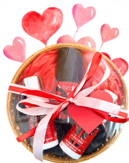
Phydra - Panier Le Calibre - Rs 995 Eau De Toilette 30ml | Aftershave Balm 50ml | Shower Gel 50ml