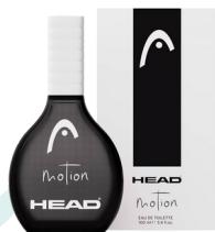
Head - Eau De Toilette Motion 100ml - Rs 1495