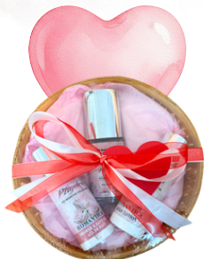
Phydra - Romantica - Rs 995 Eau De Toilette 30ml | Body Lotion 50ml | Shower Gel 50ml