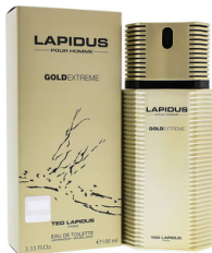
Ted Lapidus - Eau De Toilette Gold Extreme 100ml - Rs 2400