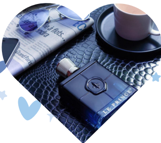
Bentley - Eau De Parfum Monsieur Le Prince Intense 100ml - Rs 4295