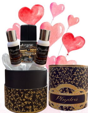
Phydra - Cannister City Life For Men - Rs 1285 Eau De Toilette 50ml | Body Lotion 50ml | Shower Gel 50ml