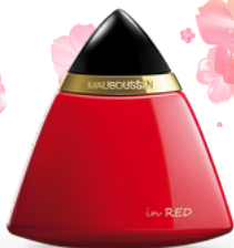
Mauboussin - Eau De Parfum In Red Femme 100ml - Rs 3400