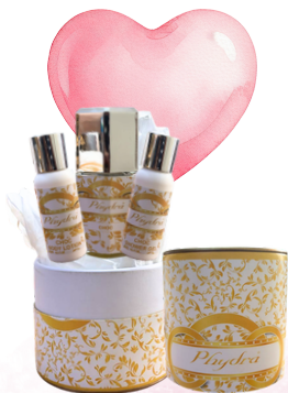
Phydra - Cannister Choc - Rs 1285 Eau De Toilette 50ml | Body Lotion 50ml | Shower Gel 50ml